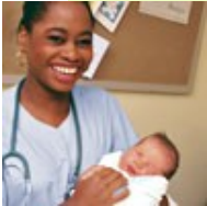
CNA—A rewarding career!

This course has been approved by the Connecticut Department of Public Health. Upon satisfactory completion of the program, students are awarded the required state certification.